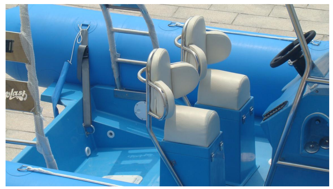
Passenger sighting and whale watching boat.